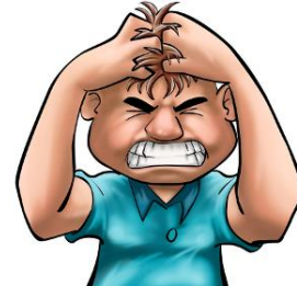
Upset or nervousness