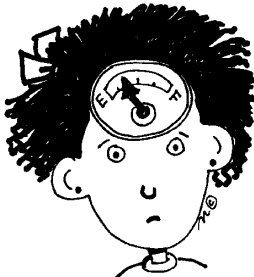
Memory loss or mild confusion