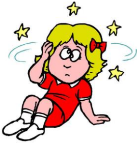
Shakiness or Dizziness