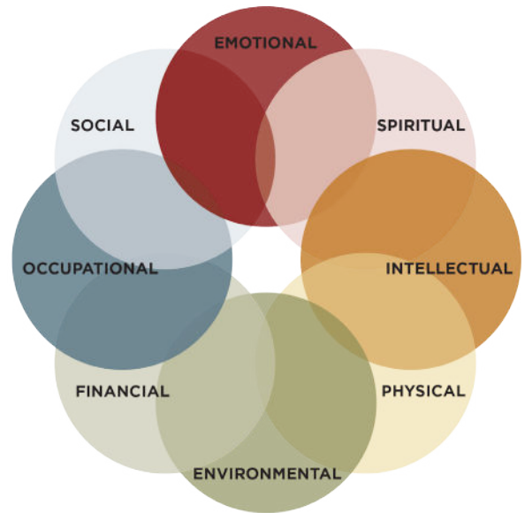
EIGHT DIMENSIONS OF WELLNESS*

We also recognize that we live in a multicultural world, and wellness encompasses areas that may not be specified in this brief discussion. We believe, for example, that trauma is a universal human experience, and that our culture and spiritual beliefs impact our perceptions and everything we do. In summary, wellness is about how we live our lives and the joy and fulfillment and health we experience.